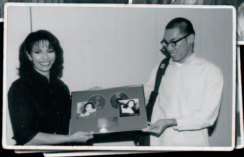
Gold and Platinum in Asia